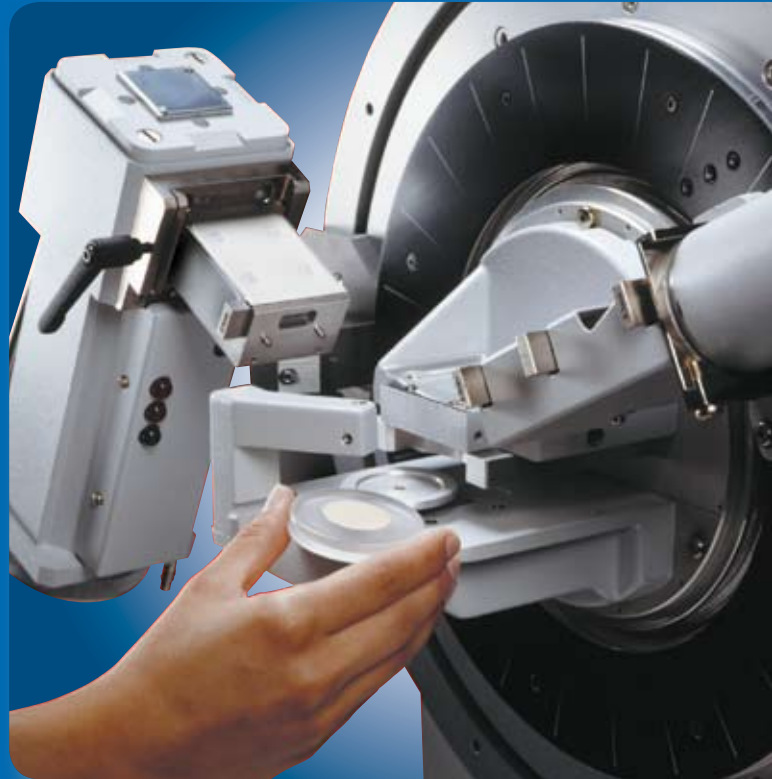
Push-Plug technology: hanging sample holders as well as complete configurations has never been easier!

Our unique Push-Plug technology allows effortless exchange of optics, sample holders or detectors without realignment. The D8 FOCUS is your dedicated performer, providing highly efficient solutions for most applications in X-ray powder diffraction. It provides a flexible platform for future expansion by offering numerous accessory options that will grow with your needs.