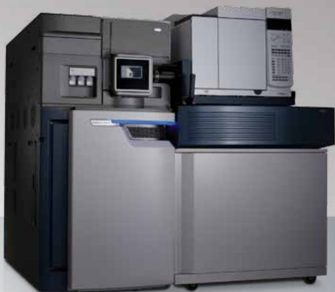
SYNAPT G2-S HDMS System with APGC.