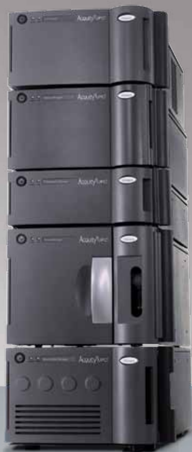
ACQUITY UPC 2 System.