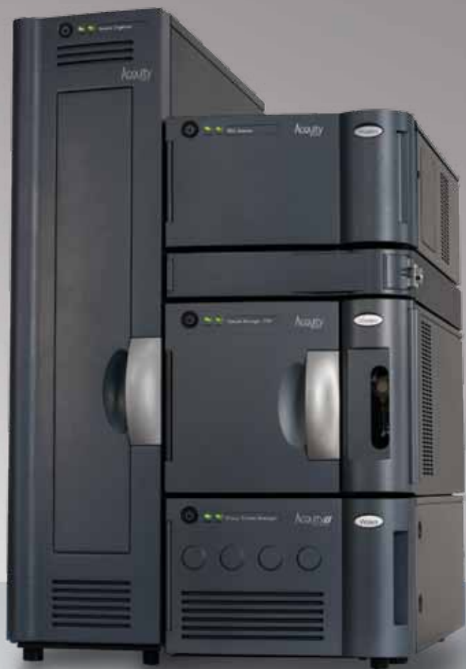
ACQUITY UPLC I-Class System.