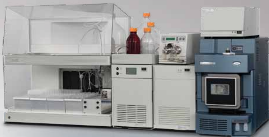
AutoPurification System with SQ Detector 2.