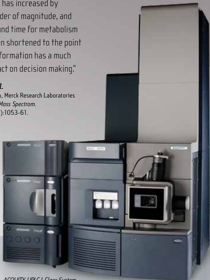
ACQUITY UPLC I-Class System with the Xevo G2-S ToF.

Drug Metabolism, Merck Research Laboratories Rapid Commun. Mass Spectrom. 2008 Apr; 22(7):1053-61.