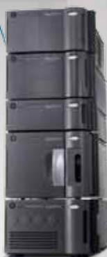
ACQUITY UPC 2 System.