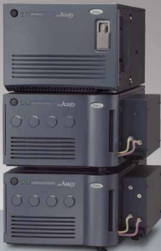
nanoACQUITY UPLC System with HDX Technology.