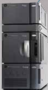
ACQUITY UPLC H-Class System.