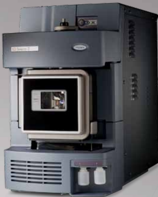
SQ Detector 2.