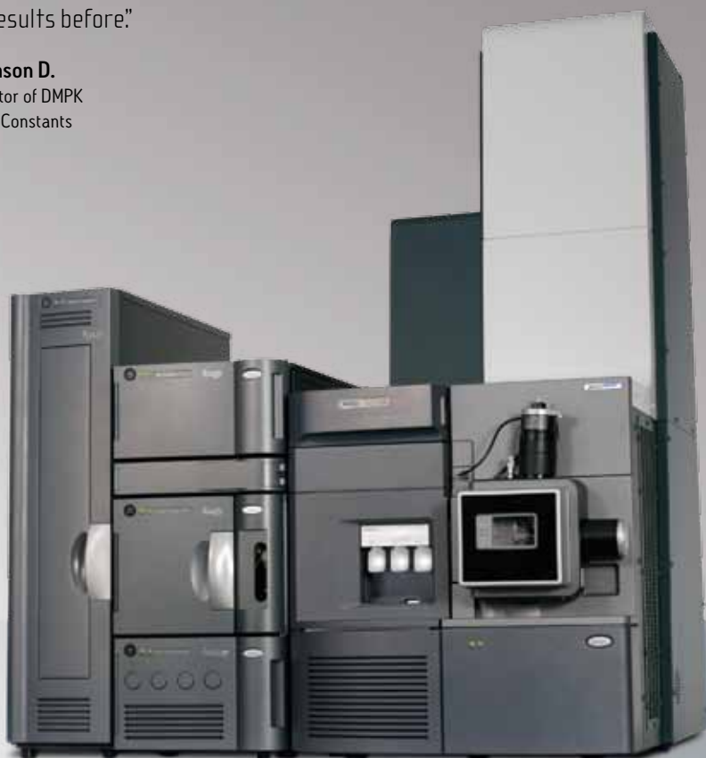
ACQUITY UPLC I-Class System with Xevo G2-S QToF.