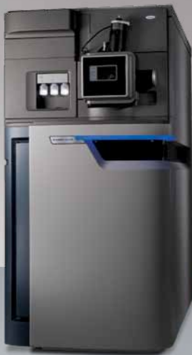
SYNAPT G2-S HDMS System.

University of Warwick UK Doubling Up On Mass Analysis Chemical & Engineering News 2010 Mar; 88, 13:35-37.