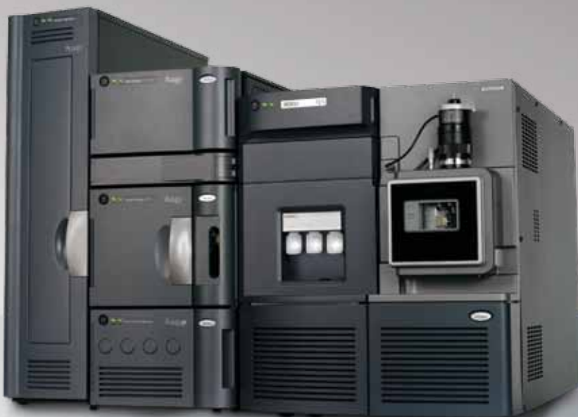
ACQUITY UPLC I-Class System with Xevo TQ-S.

Method Development Manager Unilabs York Bioanalytical Solutions