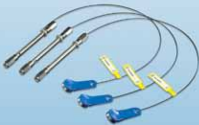
SEC and IEX columns for analytical applications.

Waters is dedicated to providing innovative UPLC solutions as well as traditional HPLC-based offerings for the separation, analysis, and characterization of DNA/RNA, amino acids, peptides, proteins, and glycans. Beginning with a keen understanding of today's biomolecule-related challenges, Waters chemistry operations scientists and engineers continuously seek purposeful innovations that help deliver impactful solutions in applications, ranging from proteomics and biomarker discovery through the commercialization of advanced biopharmaceuticals.