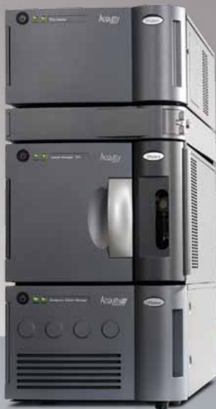
ACQUITY UPLC H-Class System.