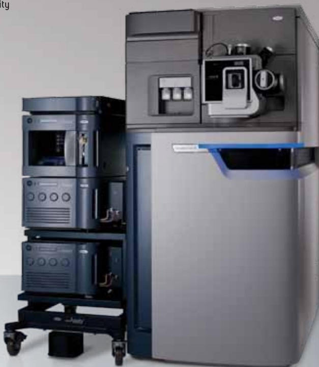
nanoACQUITY UPLC System with SYNAPT G2-S HDMS.

Senior Research Officer, Department of Chemistry Durham University