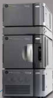
ACQUITY UPLC I-Class System.