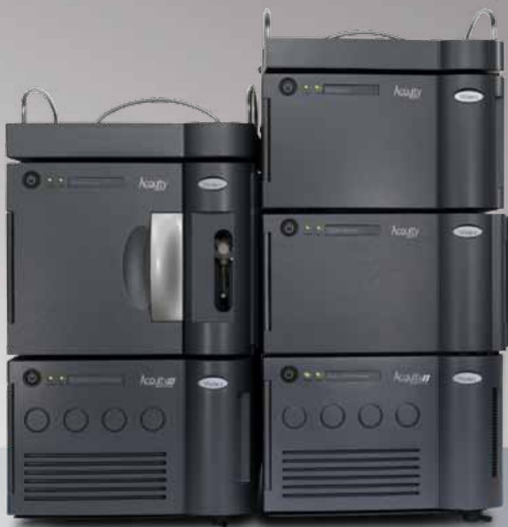
ACQUITY UPLC I-Class System with 2D Technology.