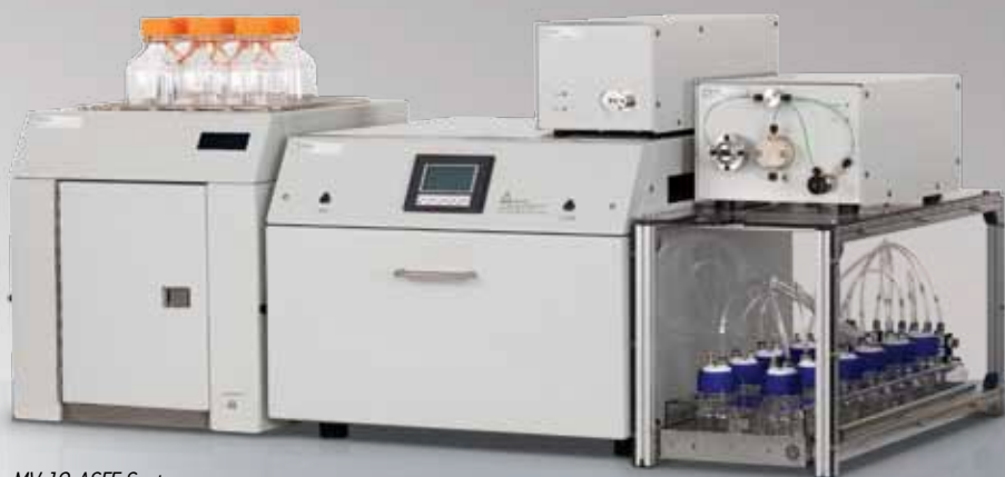
MV-10 ASFE System.