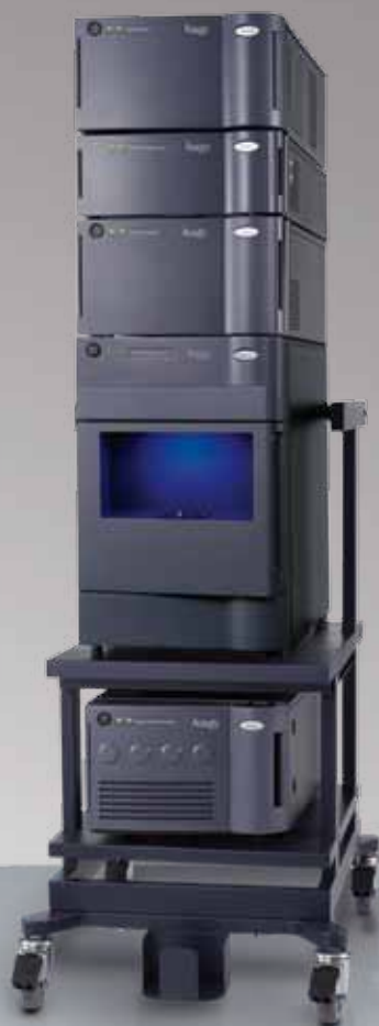
PATROL UPLC Laboratory Analyzer System.