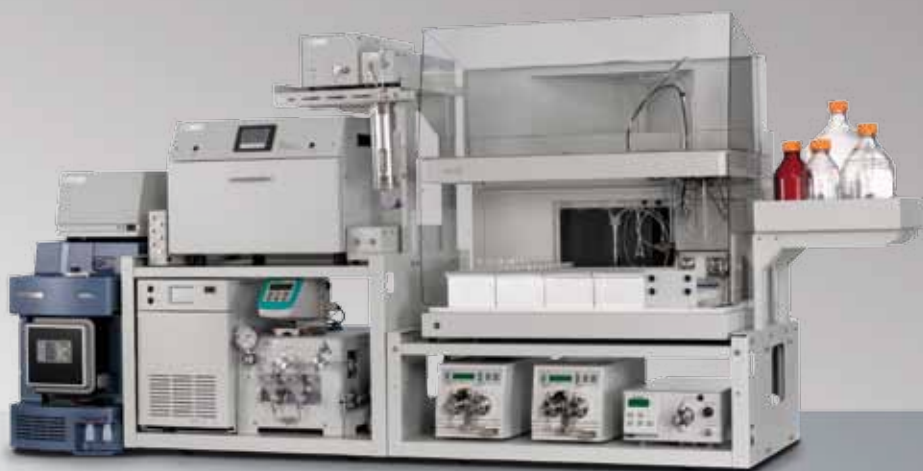
Prep 100 SFC System with SQ Detector 2.