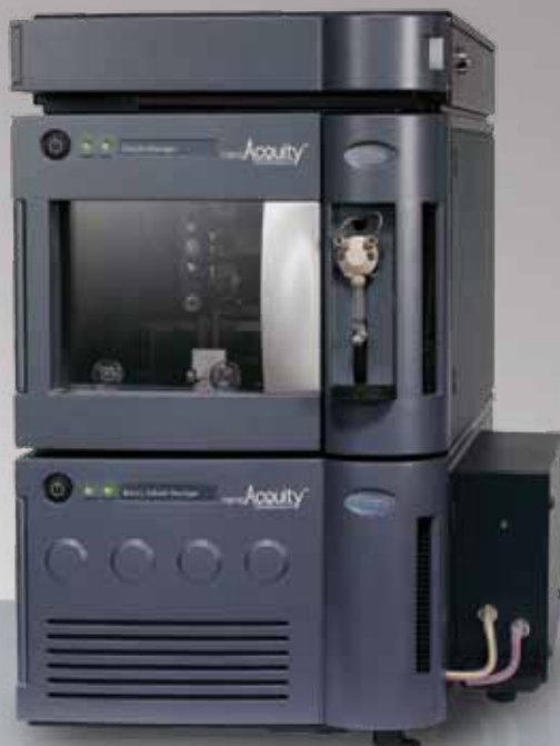
nanoACQUITY UPLC System.

Special Program Investigator Van Andel Institute