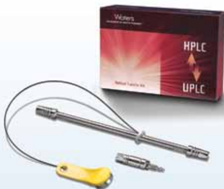
ACQUITY UPLC Column, VanGuard Pre-Columns, and Method Transfer Kits.

With a seemingly endless number of method parameters to try, developing a new chromatographic method can be an overwhelming and time-consuming experience. Waters Method Development Kits consist of several UPLC Columns, encompassing a broad range in selectivity to accommodate your method development approach and enable more efficient and effective method development.