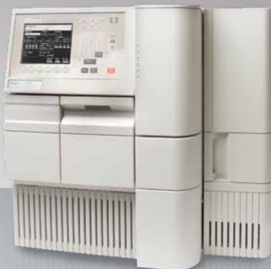
Alliance HPLC System.