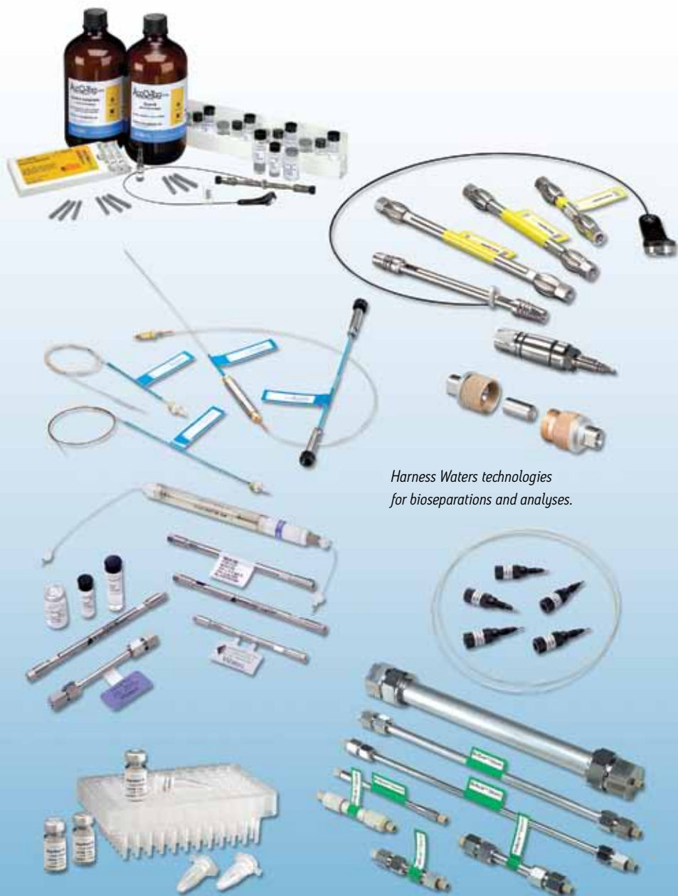
Harness Waters technologies for bioseparations and analyses.